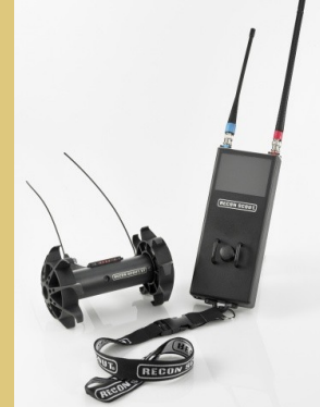
Recon Scout XT