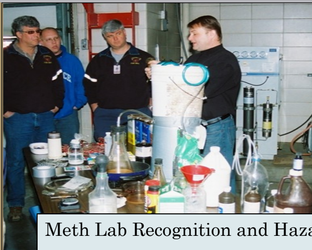
Meth Lab Recognition and Hazards

Do you know that law enforcement protocols mandate that Emergency Response Personnel must be on site during a meth lab incident in the case of a catastrophic event? When that happens, they are going to turn to you... Would you know how to respond?