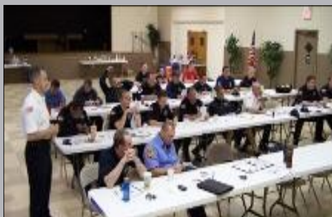
Prepare a briefing before responding to a Meth Lab incident