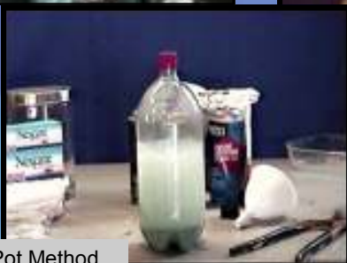
One Pot Method